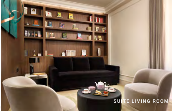
SUITE LIVING ROOM