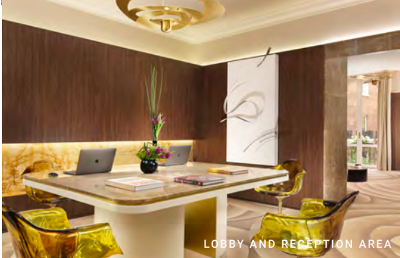
LOBBY AND RECEPTION AREA