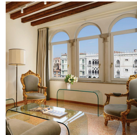
L' Orologio Apartment