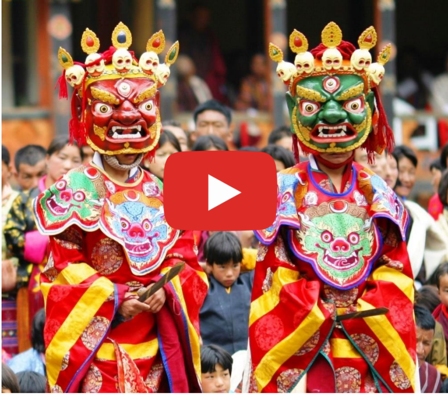
(Featured video courtesy Bhutan Tourism)