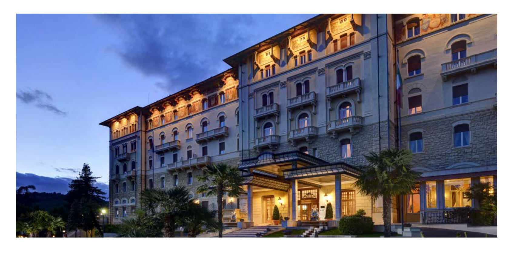
PALAZZO FIUGGI WELLNESS MEDICAL RETREAT

Wellness Medical Retreat just 40 mins from Rome!