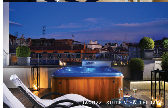
JACUZZI SUITE VIEW TERRACE